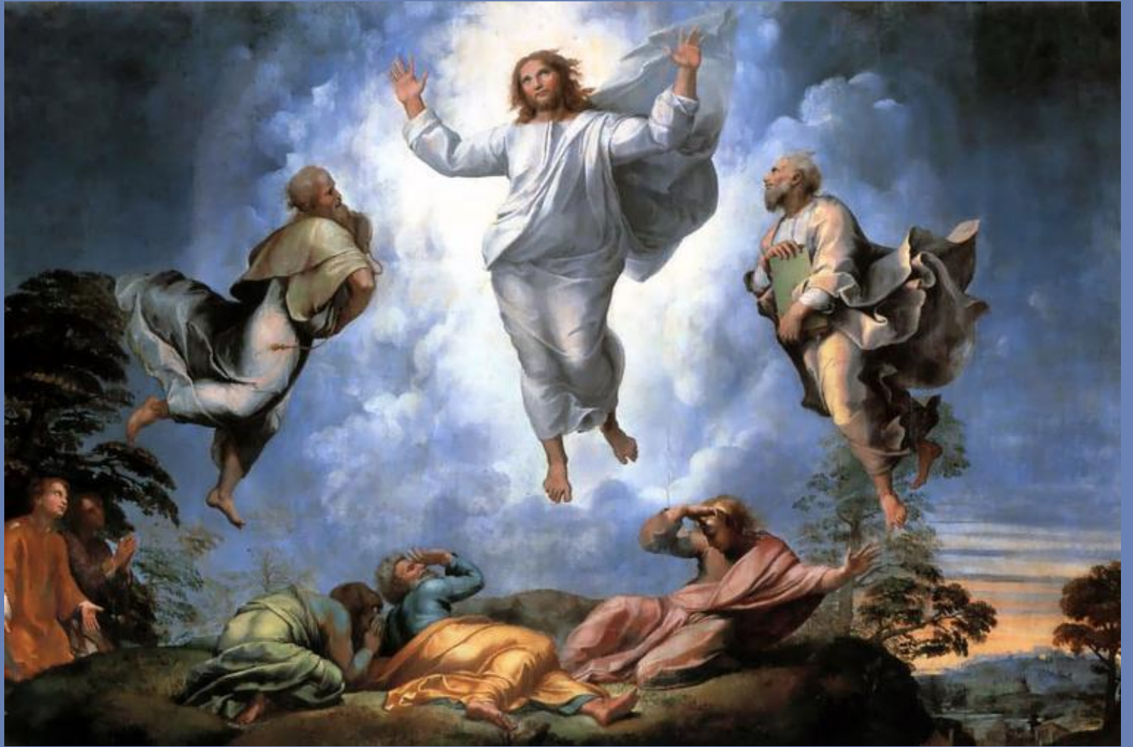
Raphael (1483-1520), "The Transfiguration "